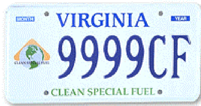
Figure 3. Virginia Clean Special Fuel License Plate.

Only vehicles with clean special fuel license plates are authorized to use the HOV lanes in Virginia without meeting the occupancy requirements. An individual must apply to the Virginia DMV for the special plates. A vehicle owner must submit the application and documentation to the DMV headquarters Special License Plate and Consignment Center. Staff at the Center reviews the application and documentation and determines if the vehicle qualifies for the clean special fuel license plate. The special plates and an invoice are sent to the owner of qualifying vehicles. Figure 3 illustrates the Virginia clean special fuel license plate.